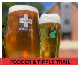
FODDER & TIPPLE TRAIL