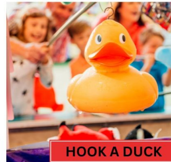
HOOK A DUCK